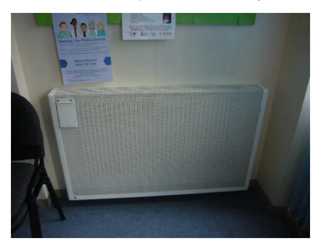
The radiator valve in this room is faulty and cannot be turned down so the temperature was excessive.

In addition to the consulting rooms used by the practice, a health education room is sometimes used by Swindon Borough Council health visitors and for other meetings.