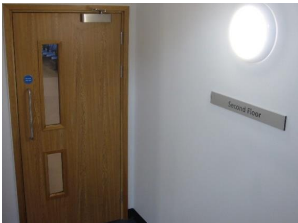
Home made signs indicate floors. But doors from landings on each floor give no clue as to what lies the other side.

People using the stairs have to guess what lies behind the anonymous doors on each floor. Signage on leaving the lift is inadquate and has already resulted in home printed signs indicating which floor has been reached.