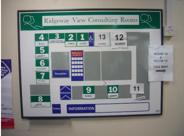
Door signs and building plan