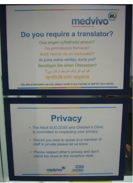
Walk-in and Urgent Care reception desk signs

Medvivo, alone, acknowledges that patients might be speakers of languages other than English and that the reception areas are far from private. It is not obvious to patients on arrival which hole in the glass screens to speak through although there are small signs over two windows indicating "urgent care" and walk-in centre. When waiting on the seats provided, it is possible to hear every detail described by patients at the reception desks.