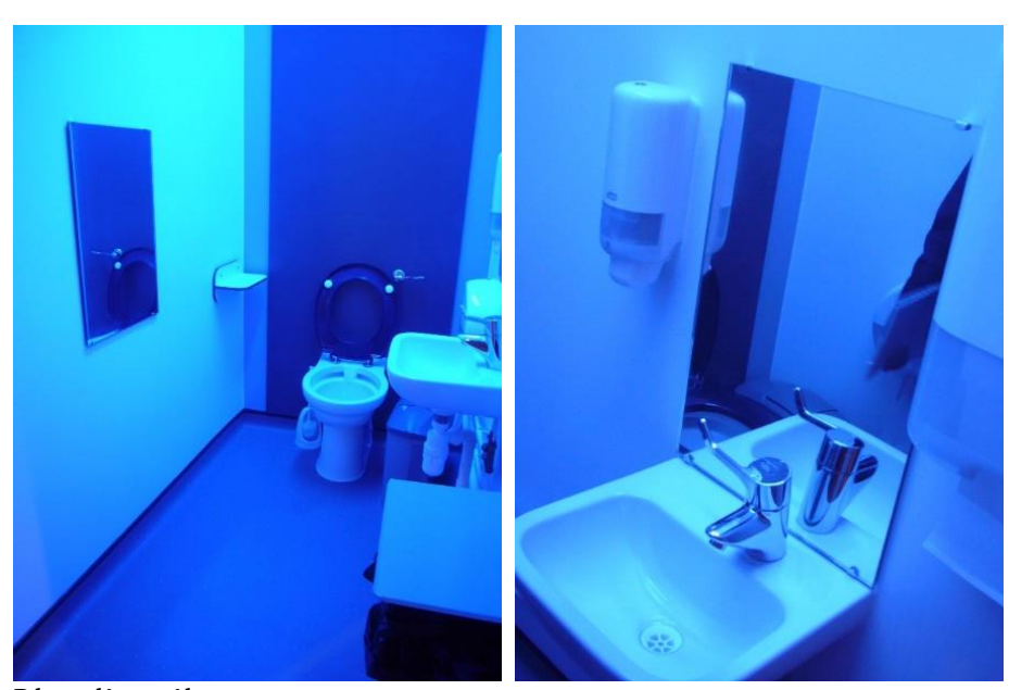
Blue lit toilets

Facilities in the toilets are variable. For example the mirrors in the male/female toilets are set at waist height for someone standing. The Equality and Access Group have made a number of comments about the accessible toilets which require attention.