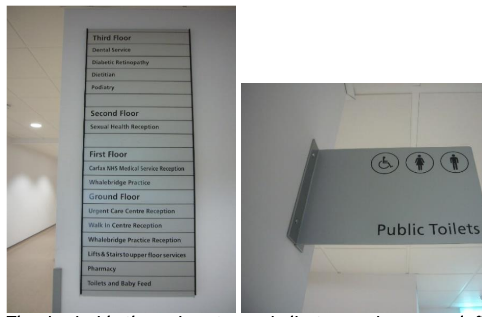
The sign inside the main entrance indicates services on each floor.

The closed window blinds and tinted door glass do not provide a welcoming aspect to the main entrance and the building appears to be closed. Great Western Hospitals NHS Foundation Trust said "the blinds are usually closed but reception will now open them in the mornings".