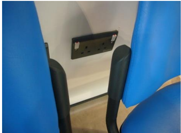
Air conditioning controls and plug sockets

Throughout the building, light switches, plug sockets and air conditioning controls are readily accessible to children. In response to this observation Swindon Children's Services said "The Health Visiting Clinical Lead did highlight that the most recent thinking about safety and plug sockets is that continually pushing socket covers into plugs may be a greater risk to safety than uncovered plug sockets, particularly in a venue where products such as hair straighteners etc. are highly unlikely to be plugged in by a child accidentally. There is an expectation regarding supervision of young children in public..."