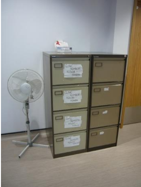
Sexual Health Service reception

The sexual health service is on the second floor. There is insuffient space for files in the administrative area and some were being stored in locked cabinets in the waiting area when we visited. Great Western Hospitals NHS Foundation Trust confirmed that they were subsequently moved out of the waiting area.