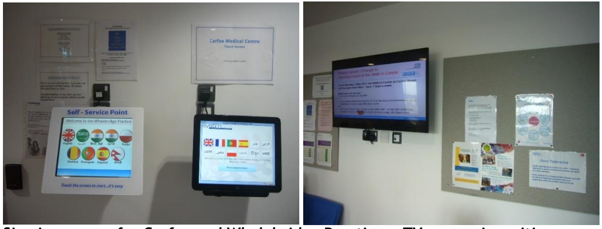
Sign in screens for Carfax and Whalebridge Practice + TV screen in waiting area.

Most people we spoke to were pleased to be attending a new building - some for the first time. There were, however, comments about the difficulty getting through to Carfax Medical Centre on the telephone.