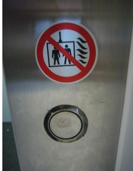
Lifts and signs

A (presumably) staff member was observed pushing, rather than pulling a large trolley out of a lift almost knocking down two adults and a child waiting for the lift to arrive on the ground floor.