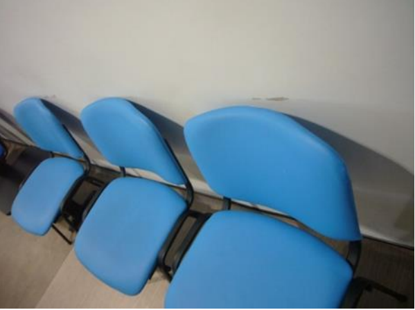
Fixed and not fixed (lighter blue) chairs - the latter damaging the wall.