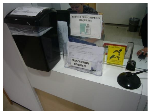
The Whalebridge Practice reception desk

As with all the reception desks in the building, there is insuffient space for the purposes to which it is being put. Again there was no knowledge by reception staff of the advertised hearing loop. The Whalebridge Practice told us they would remind staff about this".