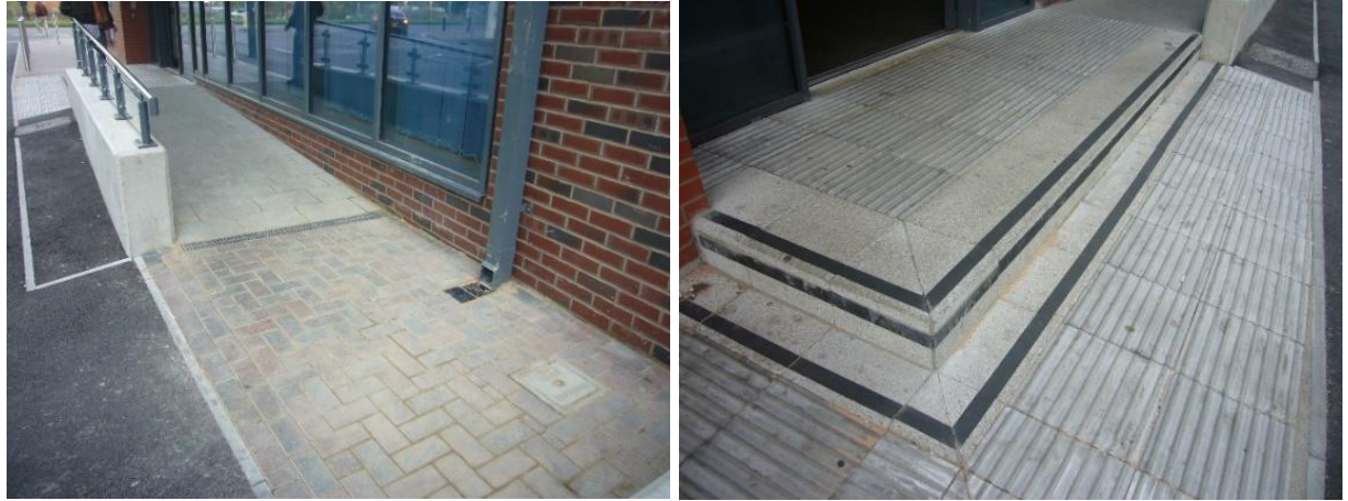
Slope and step to main entrance on Islington Street