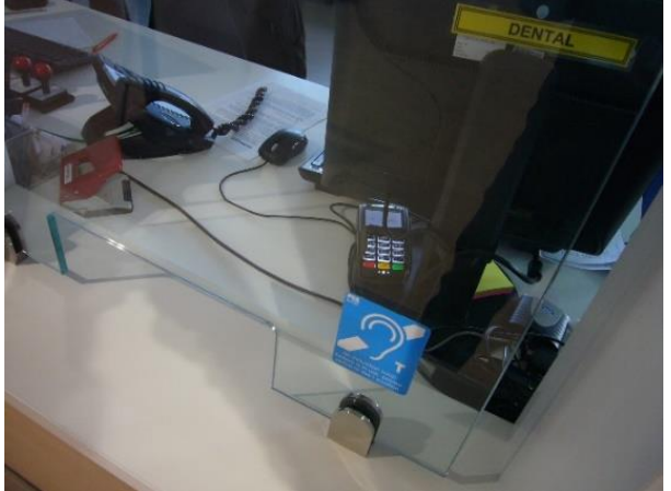
Reception desk screens