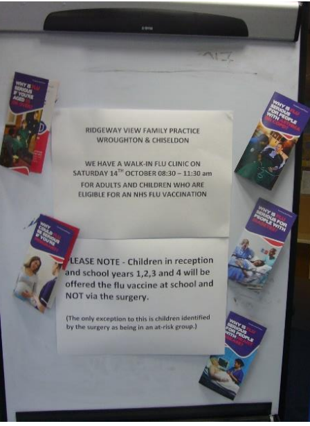
Most of the information displayed by the practice itself was ordered and up to date.