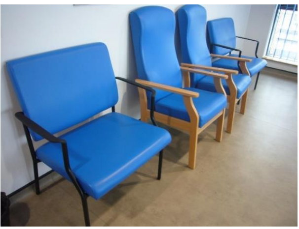
The first floor waiting area has some larger chairs and some with high backs.

People waiting are called for their appointment in person by a clinician who then accompanies them through a pass-controlled door. Some people told us they thought a screen displaying the patient's name would be helpful.