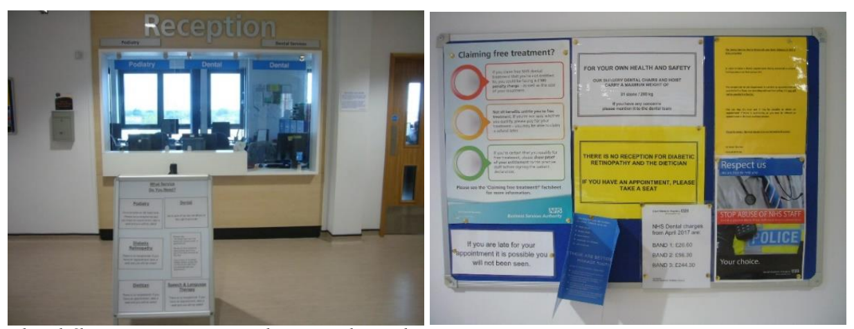
Third floor reception and notice board

We started our Enter and View visit on the top (third) floor and worked downwards.