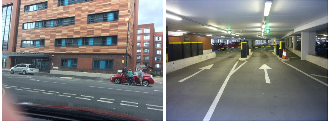
Islington Street frontage street parking and Whalebridge car park entrance

Parking for disabled drivers is available, at cost, on the ground floor of the public Whalebridge car park next to the health centre. Relatively few drivers appear to use the available spaces. Holders of blue badges park at the kerb and people can be dropped outside the health centre door in Islington Street. Nevertheless there have been repeated comments, reiterated on our visit, suggesting that there should be space for a pull-in in Islington Street mirroring one opposite outside the Thistle Hotel. The Whalebridge Practice told us "This is the responsibility of NHS Property Services".