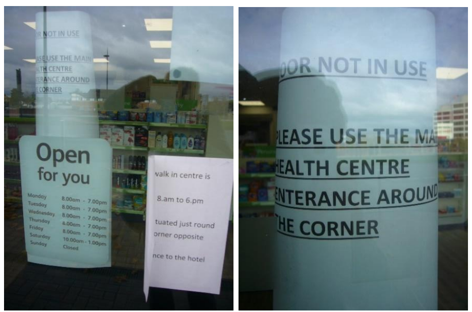
The entrance to the pharmacy on Fleming Way is not used

The pharmacy told us "The sliding electric doors were inherited from the building design. The door faces a route which is very rarely used since most people use the main entrance on Islington Street. This is especially true since they visit other departments in the health centre before they come to us. The exit/entrance is used as an emergency exit only. This has been agreed with the fire safety officer. It is actually unlocked so it is able to open as and when needed in an emergency but is not routinely used as an exit. This is also a conscious decision since many families visit the pharmacy with very young children, the electric door opens as someone moves past it and thus it reduces the possibility of any young child running out onto the main road. The other reason it remains unused is it is a real wind tunnel with both pharmacy entrances opposite each other. One further reason is the level of shoplifting. We use one entrance/exit which serves the purposes of the pharmacy and serves the main clientele which are all visiting other departments before the pharmacy".