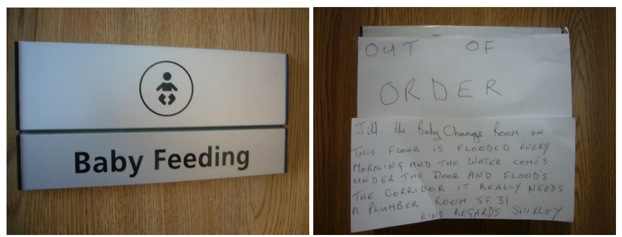
Ground Floor baby feeding room and second floor "baby change room"

Except on the door itself, there are no signs to the baby feeding/changing room which is tucked round a corner on the ground floor. It is labelled baby feeding but currently doubles as a baby changing room. It has a free-standing wooden changing unit which, like the non-matching chairs in this room, is neither new nor in keeping with the rest of the building. It gives the impression of being an afterthought.