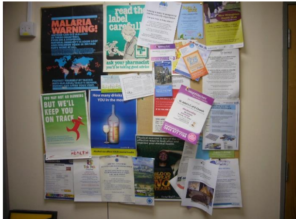
Old notices on noticeboard between surgery and community pharmacy

Beyond the main waiting area are some consulting rooms for visiting practitioners and additional office space and a space that was previously used by Swindon Borough Council's children's services.